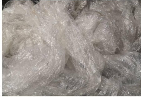
Any Kind Of Used Plastic