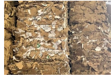
DLK Paper Bundle