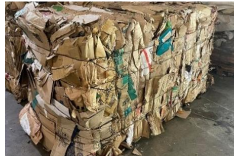
OCCA Paper Bundle