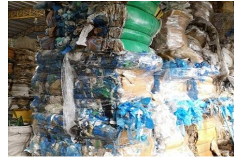
Mix Colour Plastic Bundle