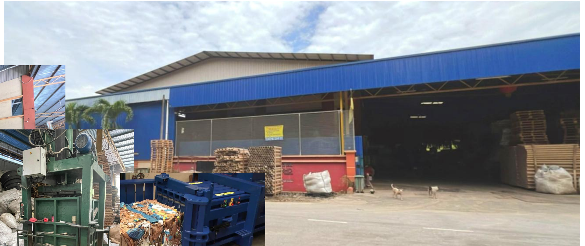
Mantin, Negeri Sembilan., Malaysia