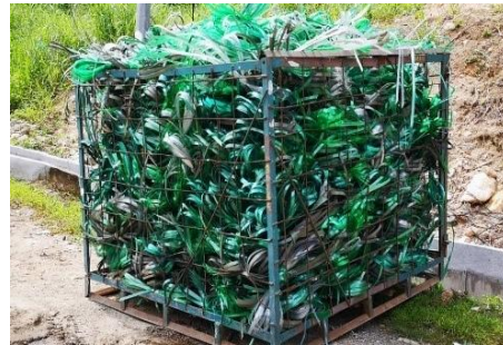
Used Strapping Band