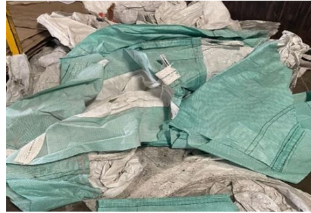
Used Jumbo Bag