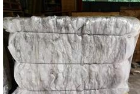
LL Plastic Bundle