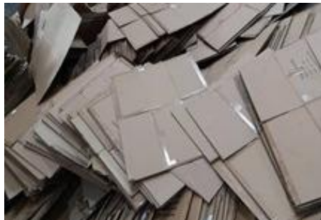
Used Carton Box